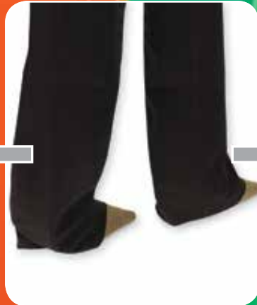
HEMLINE TOO LONG